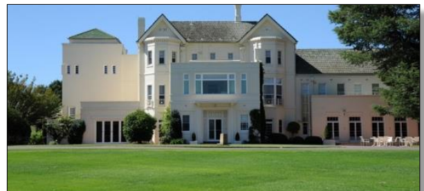
Government House .... a case for a replacement?

Whilst the official Federal Government position is to support the Constitutional Monarchy, there are many in the Coalition who privately support a republic.