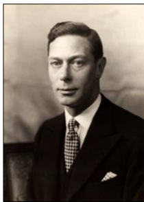
King George VI

leaders of Australia, Canada, India, the then Irish Free State, Newfoundland, New Zealand and South Africa, agreed with British leaders to form an organisation of equal members within the then British Empire.