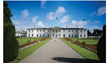
Áras an Uachtaráin (House of the President) is located in Dublin

I wish to thank them all for the considerable time they all gave me and the interest they showed in Australia’s republic debate.