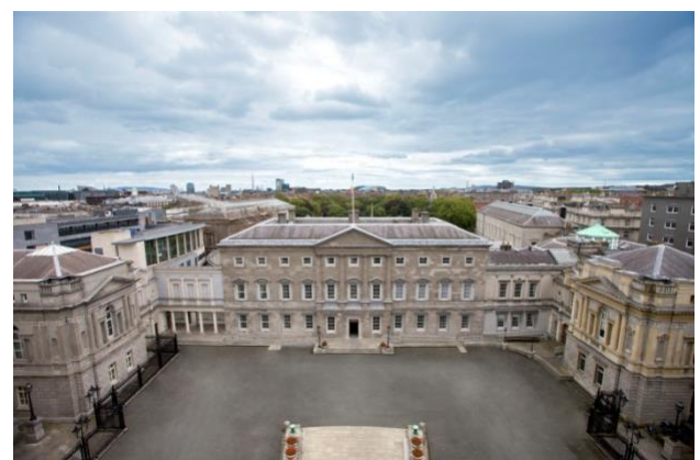
The Irish Parliament Building in Dublin

such institutions designated by law, and